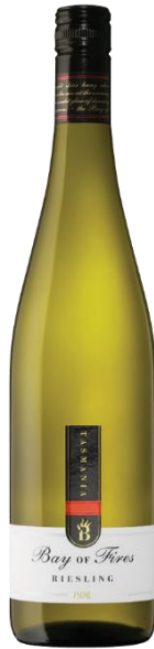
Bay Of Fires